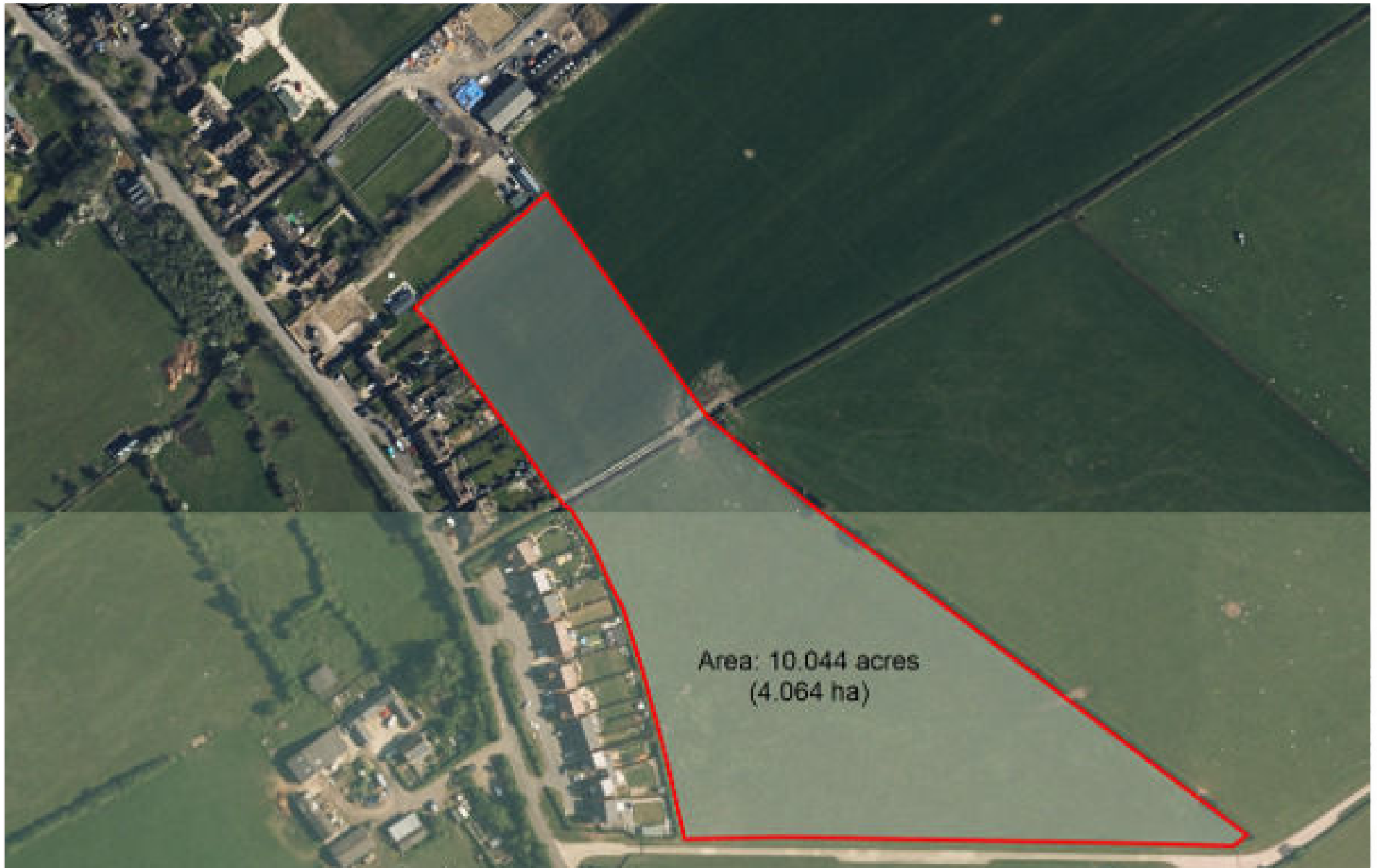
Land at Grendon Underwood Aylesbury Buckinghamshire Option or Promotion Opportunity - 10.044 acres